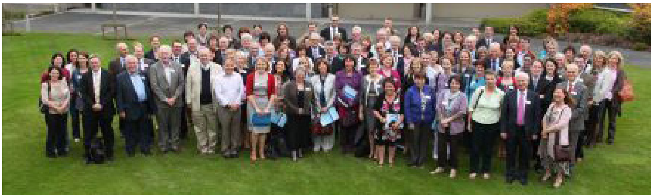
Delegates who attended the 2011 SCOTENS annual conference at the Radisson Blu Farnham Estate Hotel.