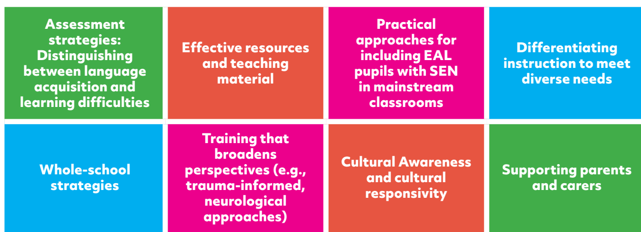
Figure 2: Suggestions for training in EAL and SEN

The information in Figure 2 was gathered from study participants across IE and NI and provides educators with eight strategy areas for effectively supporting pupils who have both EAL needs and SEN, recognising that these pupils require targeted interventions addressing the complex intersection of language acquisition and learning difficulties.